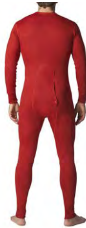
SF2500-F2 459 Red

Military Insert shoulders Back trap door Screen print on chest S-XL