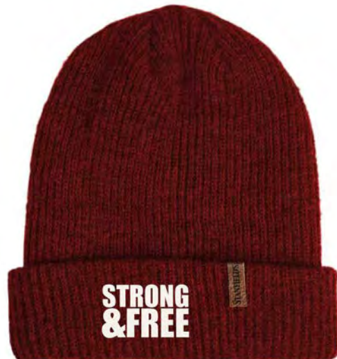
SF1321-F2 489 Port