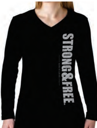
2017L-SF-SF 552 Black

50% Cotton/50% Polyester • Screen prints • S-2X