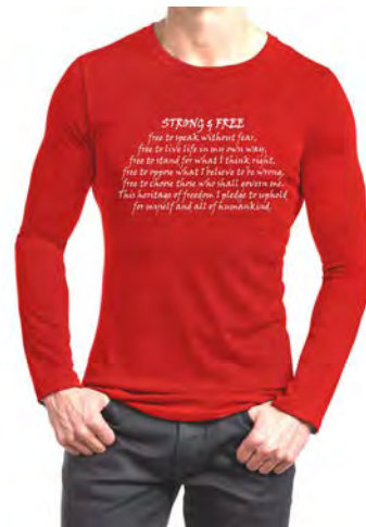
2017-M-SF 427 Classic red