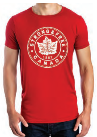
2016-M-SF 427 Classic Red