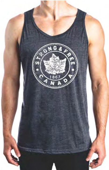
SF2046 773 Black Haze

50% Cotton/50% Polyester • Screen prints • S-2XL