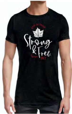
2016M-F2-SF01 552 Black