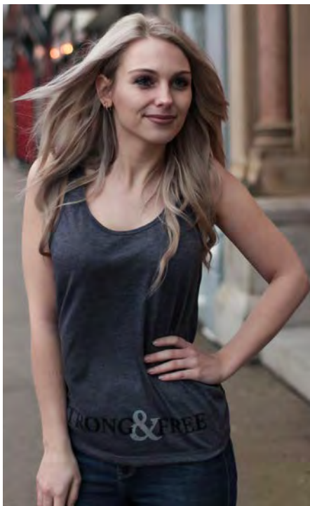
2036-SF 773 Black Haze

50% Cotton/50% Polyester • Screen prints • S-2XL