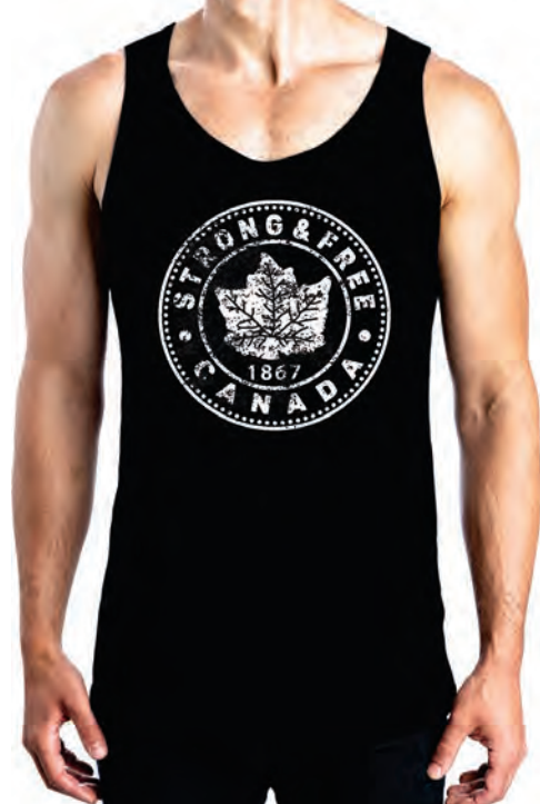
SF2046 552 Black