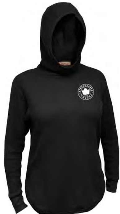
SF1406 B11 Black Coal

WOMEN'S WAFFLE HOODY 50% Polyester / 37% Cotton / 13% Rayon Embroidered Coin logo S-XL