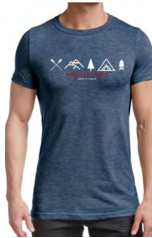
2016M-F2-SF05 A02 Navy Haze