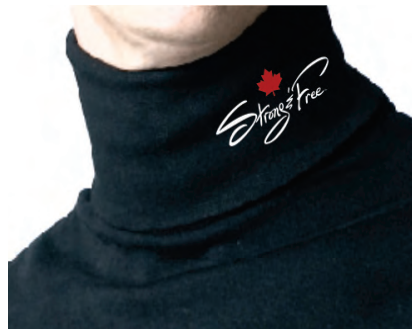
SF4640 552 Black