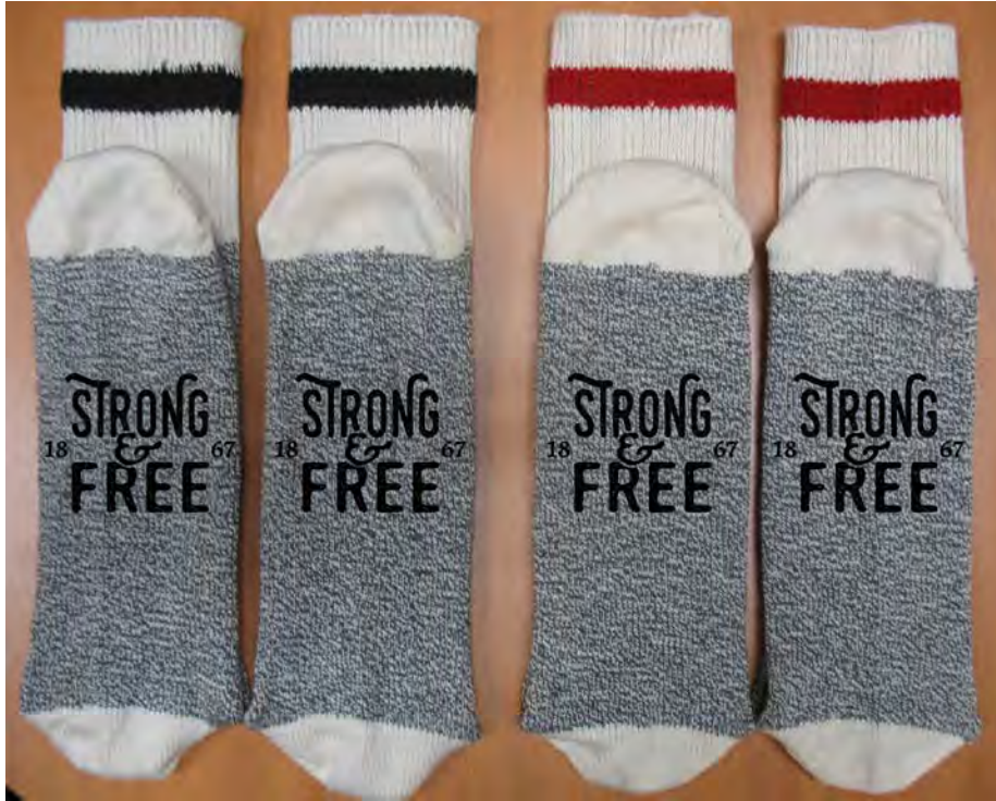
SF1344-1-F2 552 Black