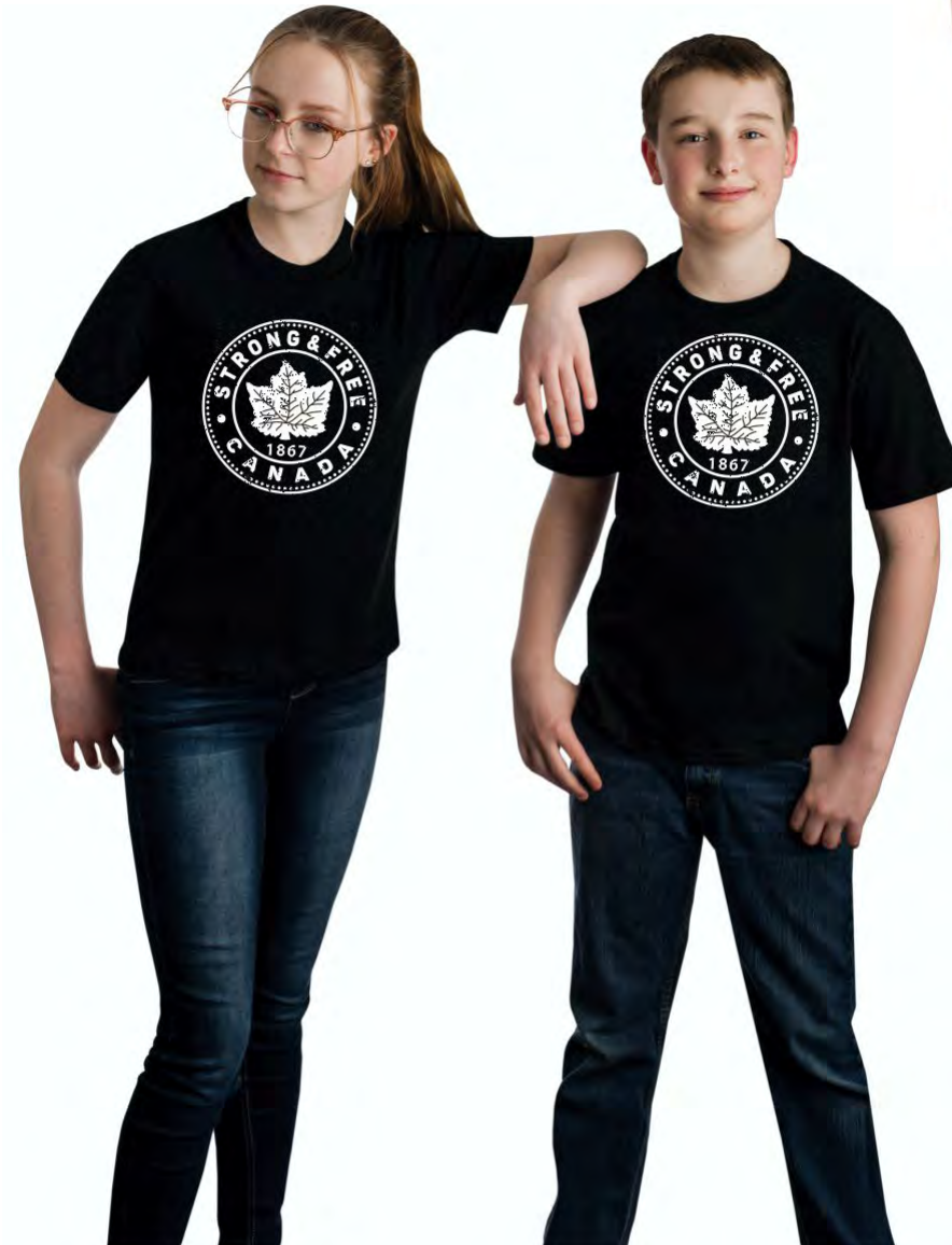
2016-Y-SF04 552 Black