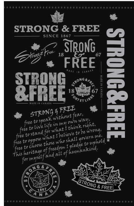
STRONG & FREE "CANDANA" 57% Acrylic / 38% Viscose / 5% Spandex Screen print of Logo collection ONE SIZE