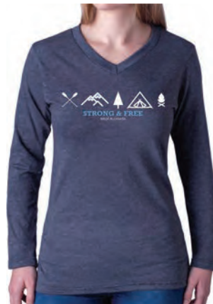
2017L-F2-SF05 A02 Navy Haze