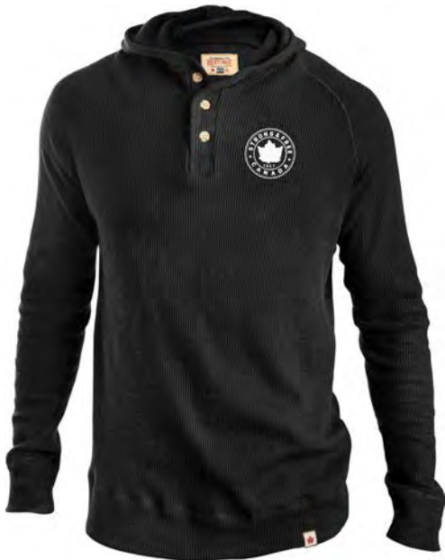
SF1592 B06 Coal

MEN'S WAFFLE HOODY 50% Polyester / 37% Cotton / 13% Rayon Embroidered Coin logo S-2XL