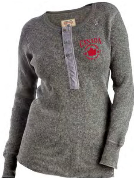
SF1315W 551 GREY MIX

80% Wool / 20% Nylon with Woven placket Embroidered Canada logo S-2XL