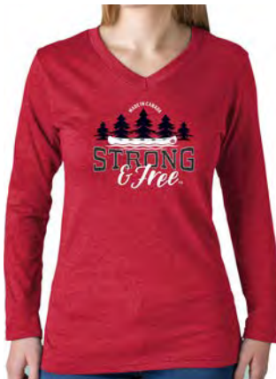
2017L-F2-SF03 A03 Red Haze