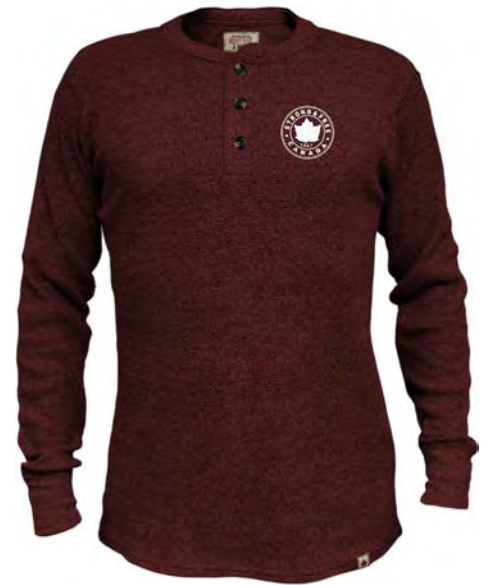
SF1401 B36 Carmine

MOCK TWIST WAFFLE HENLEY 50% Cotton / 50% Polyester Embroidered Coin logo S-2XL