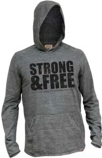
SF1399 426 Heritage Granite

50% Polyester / 37% Cotton / 13% RAYON Screen print Script logo S-XL