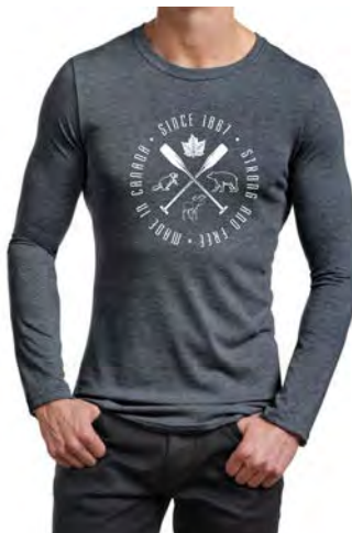
2017M-F2-SF02 773 Black Haze