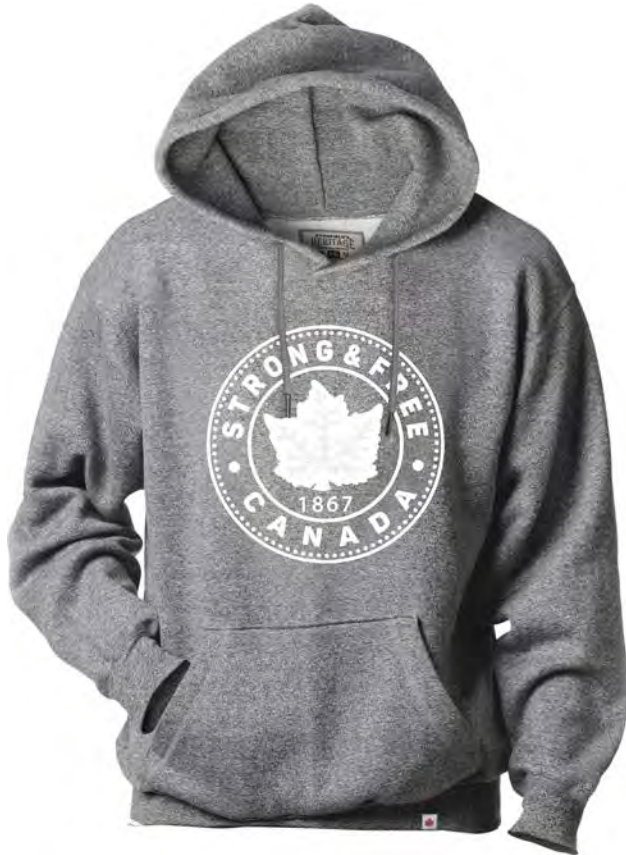
SF2026M 351 Oxford Grey

70% Cotton / 30% Polyester Set-in sleeve Screen print Forest logo S-2XL