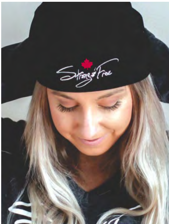
SF7506 552 Black