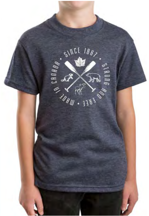
2016Y-F2-SF02 A02 Navy Haze