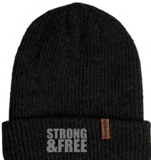
SF1321-F2 552 Black