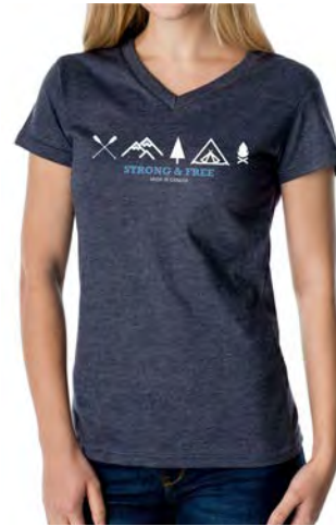
2016L-F2-SF05 A02 Navy Haze