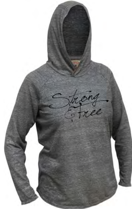
SF1400 426 Heritage Granite