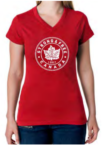
2016-L-SF 427 Classic Red