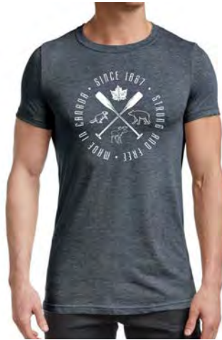
2016M-F2-SF02 773 Black Haze