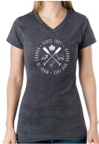
2016L-F2-SF02 773 Black Haze