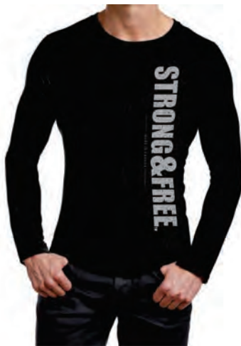
2017-M-SF-SF 552 Black

50% Cotton/50% Polyester • Screen prints • S-2X