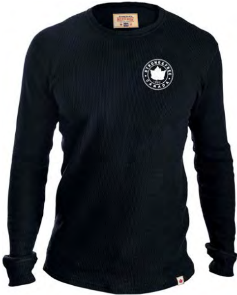
SF1523 B11 Black Coal

WAFFLE CREWNECK 50% Cotton / 50% Polyester Embroidered Coin logo S-2XL