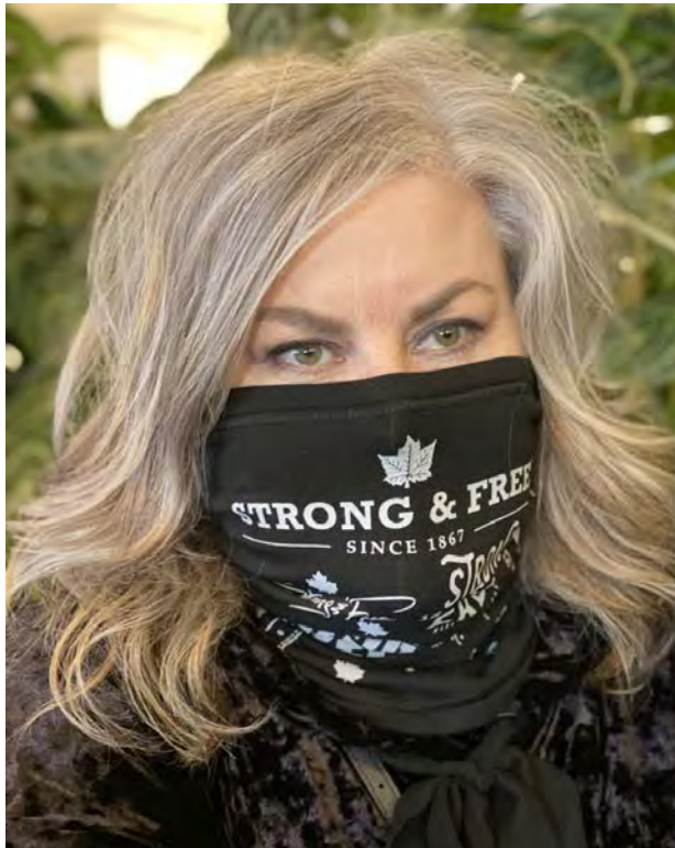
SF7505 552 Black