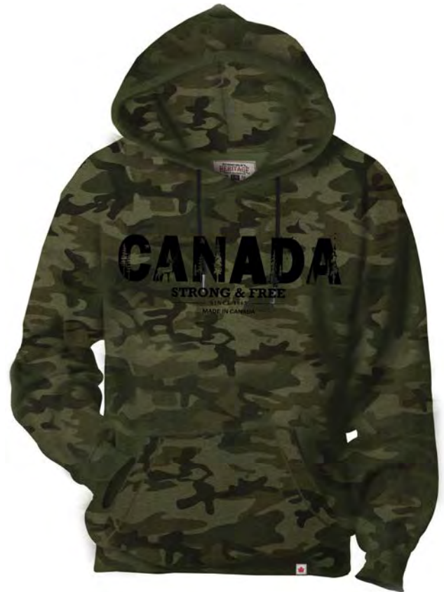
SF2026P-F2 B60 Urban Green