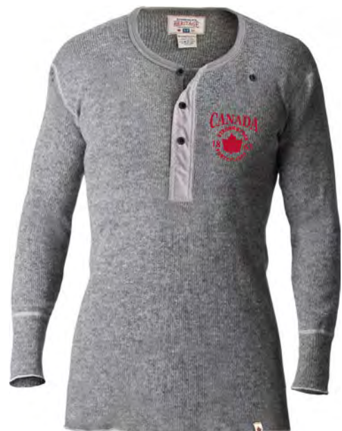
SF1328-F2 551 GREY MIX