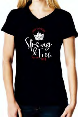
2016L-F2-SF01 552 Black